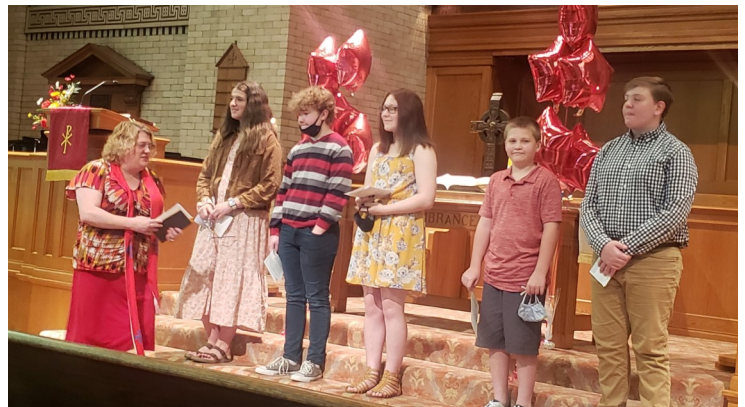
New members joining the church on Pentecost